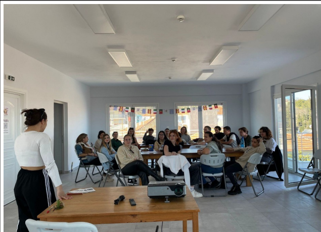
Cultural Centre of Kryoneri