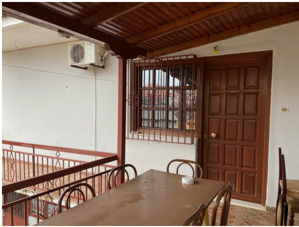
Traditional Old house