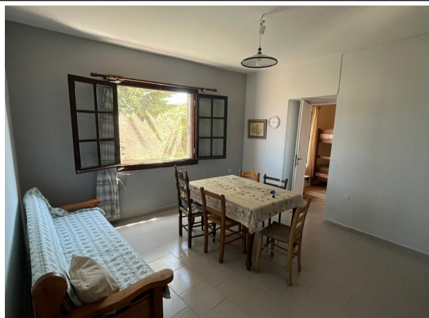
Traditional Old house