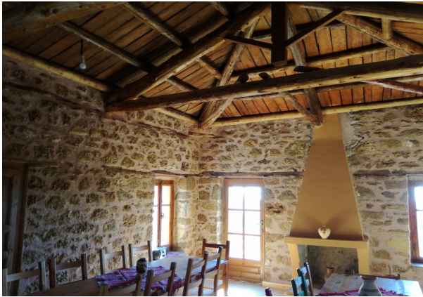
Eating room AGROIKIA