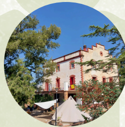
SANT ANTONI'S TOWER