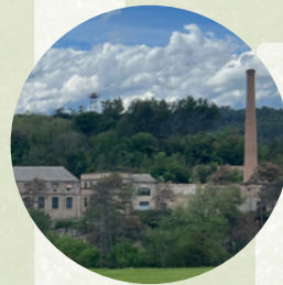
VIDÀLIA COMMUNITY EXPERIENCE