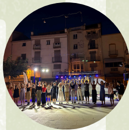
RENOVATION AND FOLK