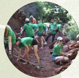
ANCIENT TRAILS MUSEUM