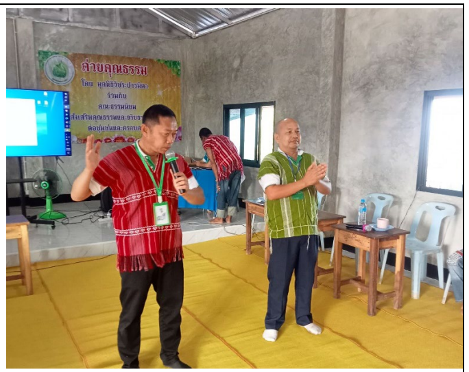
Presentation of Dharma in the monastery main room