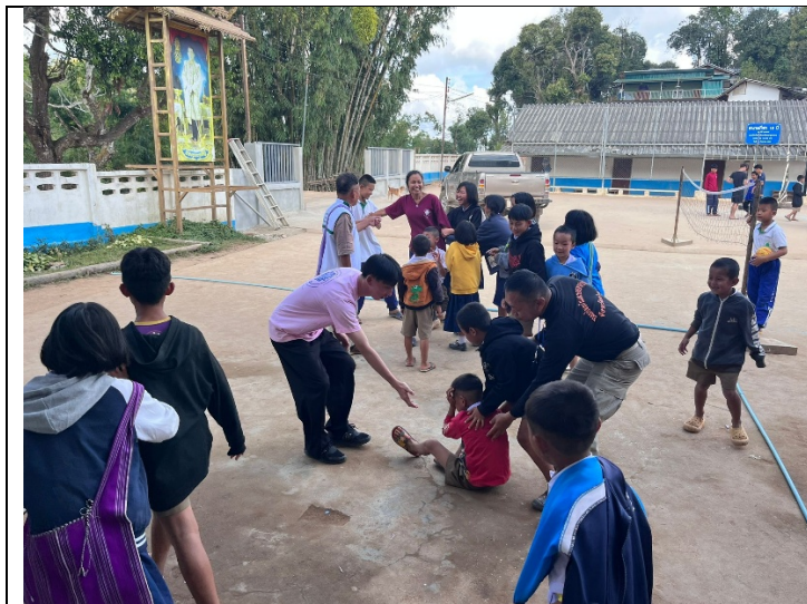
School students’ activities