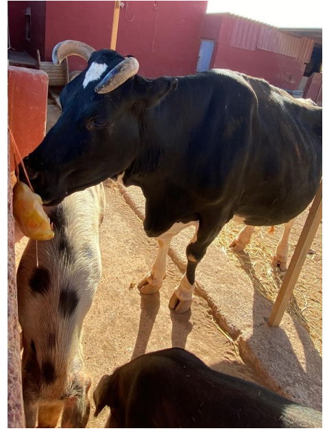
You can see the difference in the hooves in both photographs.