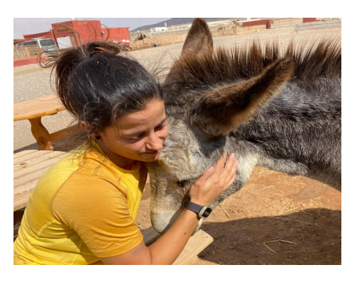
So don't hesitate, come and enjoy a beautiful experience.

The maintenance and cleaning of the house depends on everyone, the active collaboration of each member of the team is extremely important to always maintain order and cleanliness, we are all equal.