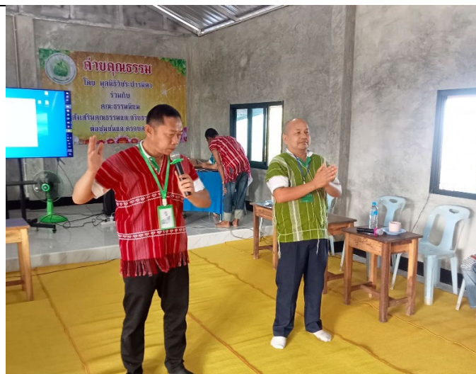
Presentation of Dharma in the monastery main room