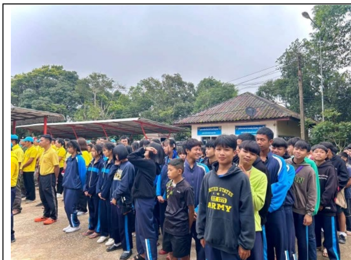
Ban Utum School students line up in the morning

It's recommended for participants to bring in some ideas for group activities to the work camp as you will spend most of your stay with your volunteer friends. Activities can be card games, songs, shows, craft skill sharing or anything that bring you guys together!