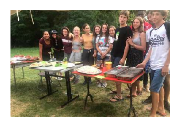
MEDIUM AND LONG TERM VOLUNTEERING