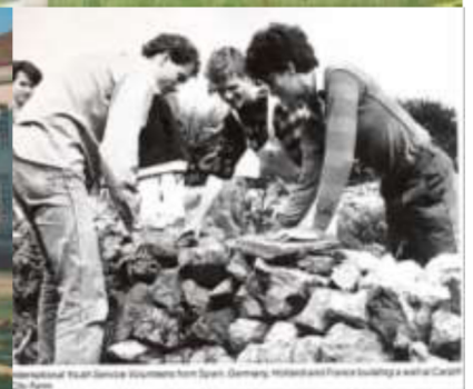
Top – recent International Volunteer projects supporting the Temple & Peace Garden; Bottom – 'from the archives' – exploring projects of the 1930s & 1980s.