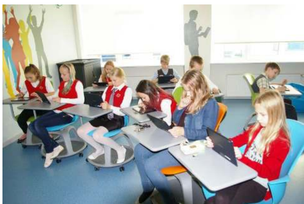
Future classroom - innovative furniture and IT technology for learning

We have a beautiful and renovated building in the center of the city. We have a future classroom (3D printer, TV, Smart-board, I-pads, new and flexible furniture etc) as of 2015. All 1st grade students begin with digital learning and robotics as part of the curriculum. Our children are learning English from 1st grade, Russian and German from 6th grade.