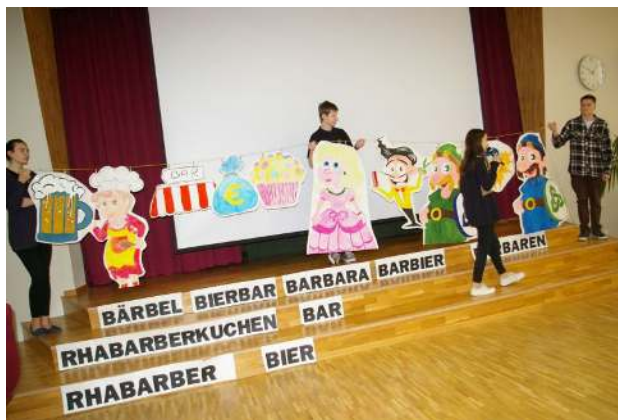
Foreign language week - 8th grade theatre performance in German