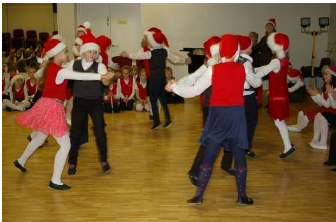
3rd grade - Folk dancing in christmas party

School also offers an after school programme until 4 pm and after that children can stay in school if they take part in several trainings, etc.