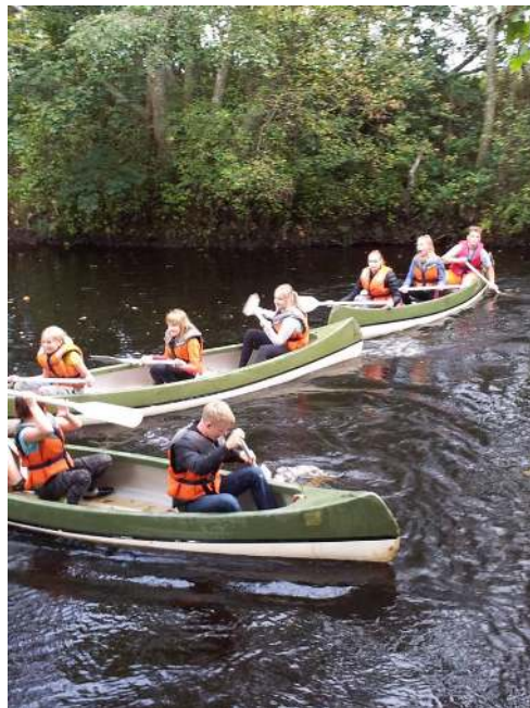
8th grade on canoeing trip