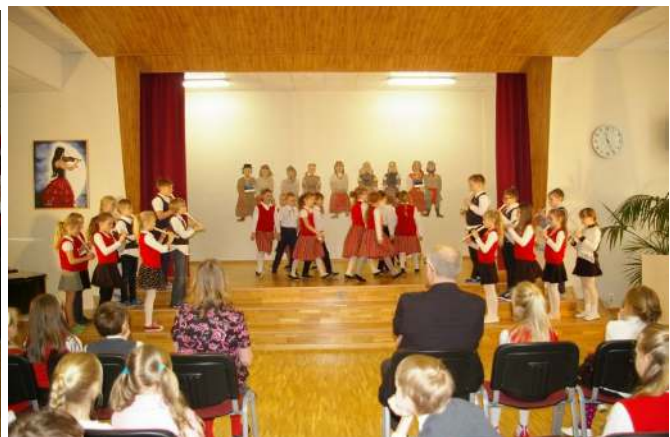
4th grade - Song, dance and flute playing on christmas concert for parents