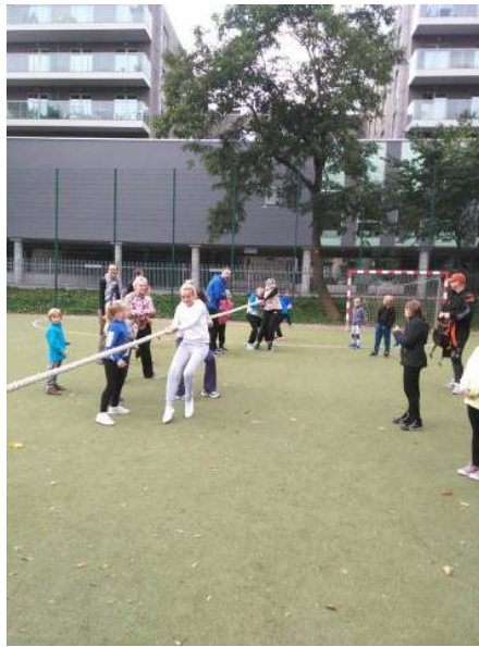
Sport day for families in school stadium

Every month our school offers the families different handicrafts workshops, concerts and sport activities. In our school there are over 20 different after school activities (sport, music, dance, art, brain games etc). Many of the activities are free of charge. School also offers an after school programme until 4 pm and after that children can stay in school if they take part in several trainings, etc.