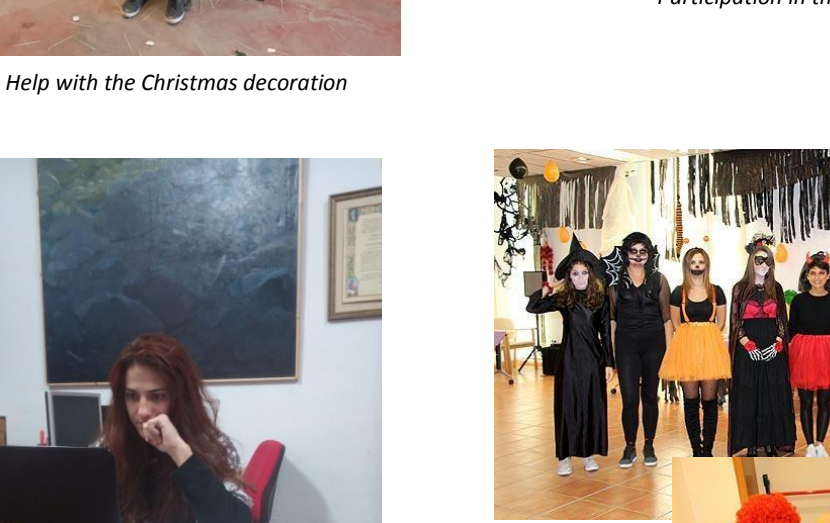
Help in the design of posters