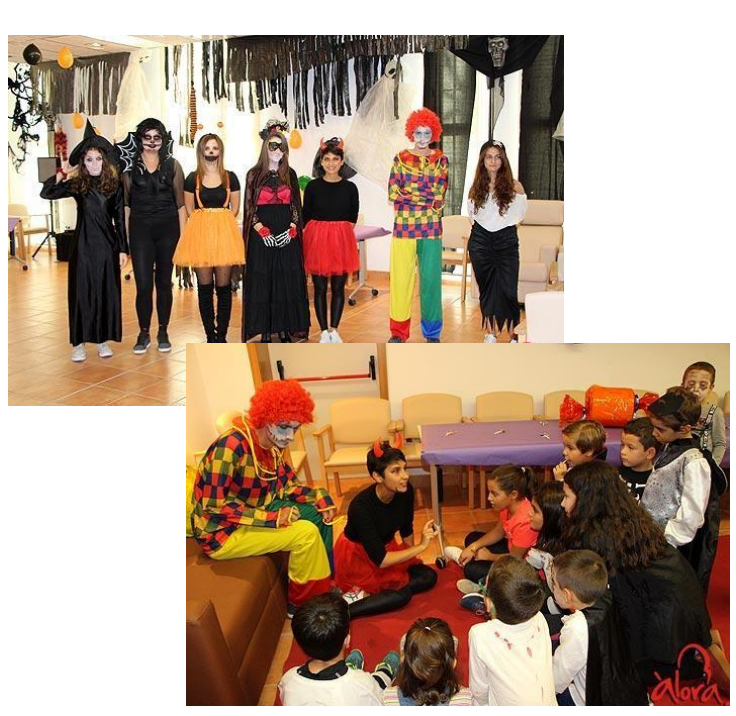
Participaione in the Halloween party for children