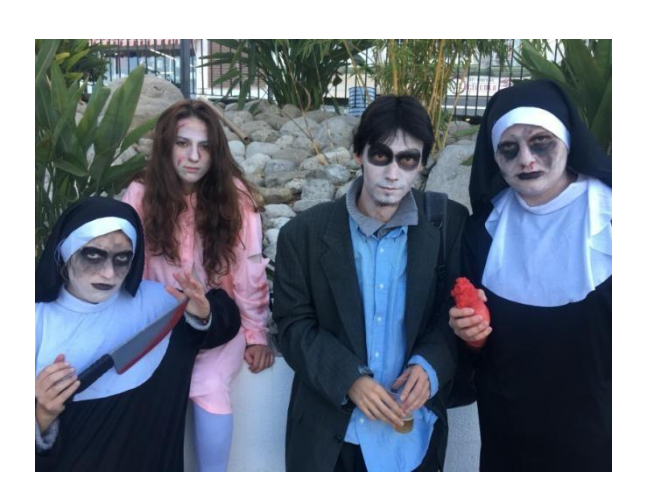
Participation in the horror walk for Halloween